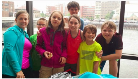
Last year's bike hike.

The end of the year is coming soon. The end of it is June 2nd. Many events happen now that school is so close to an end, until September. We have the bike hike for instance, which is a fun event where all the 4th & 5th graders bike all around town and stop for a treat along the way. Also, there's the talent show which is on May 20th at 10:00. Soon, the 5th graders will get to tour the school Horace Mann in preparation for 6th grade. We also have Lennon & Ruthven Theaters Co. that is coming to present a great play: Geology Rocks. Before you know it it'll be field day, signaling the last days of school. Please check out the important dates at the bottom of the newsletter.